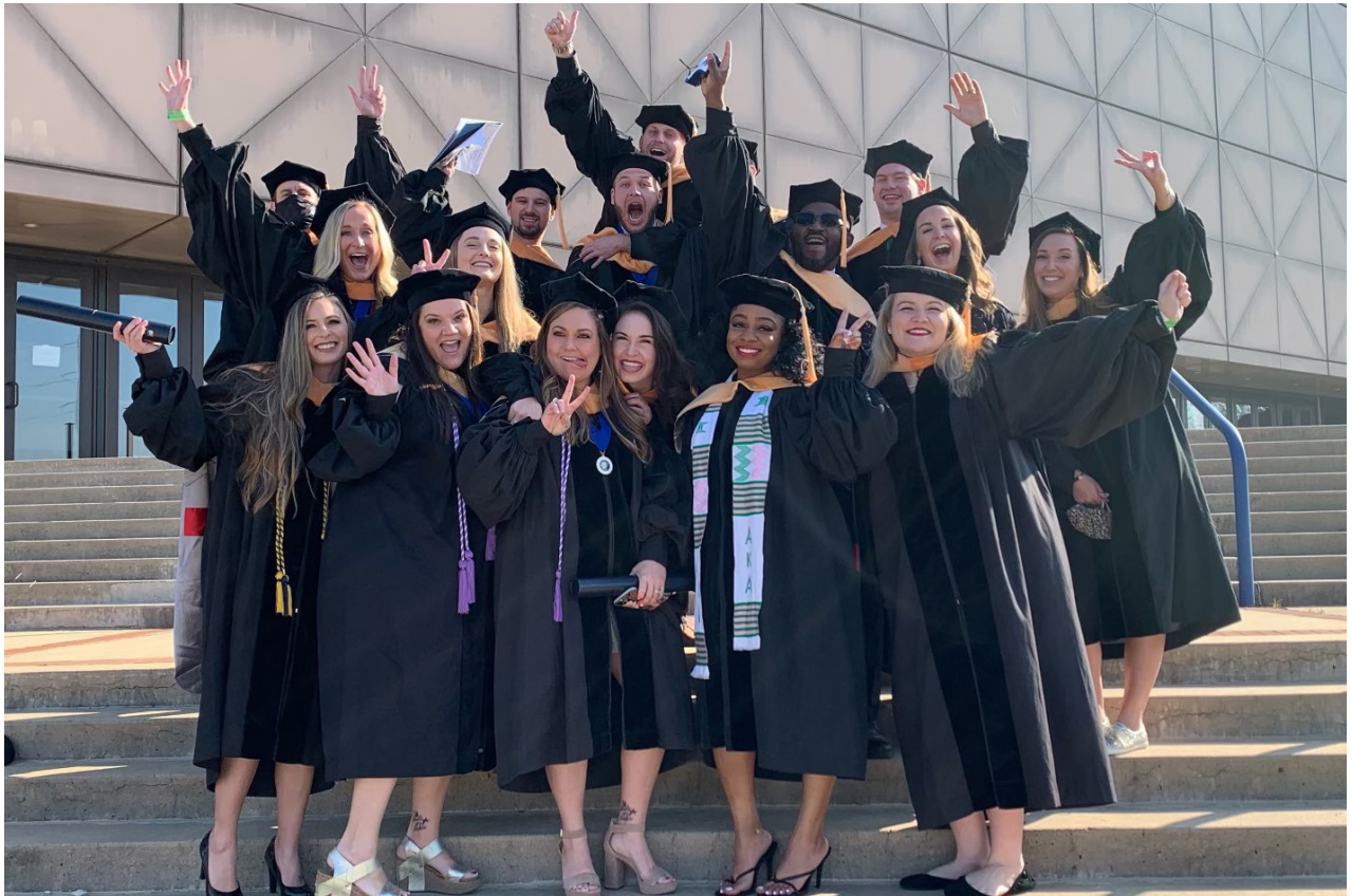
Augusta University Graduating Class of 2020