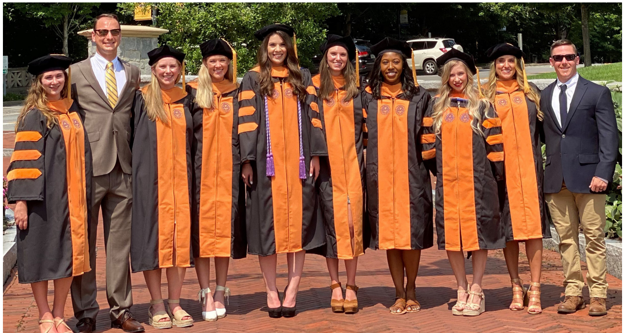
Emory University Graduating Class of 2020