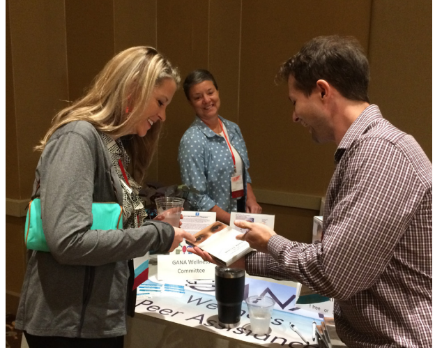
SRNAs at the Wellness Exhibition 2019 Georgia Anesthesia Symposium in Atlanta, GA October 4-6, 2019