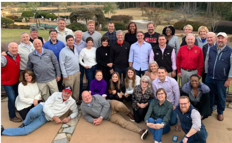
State Senator Republican Caucus and GANA leadership at Callaway Gardens Lodge and Spa