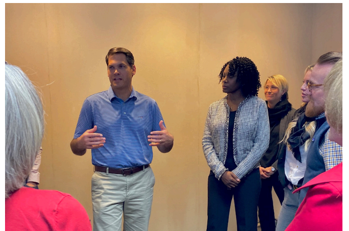
Lt. Governor Geoff Duncan and GANA leadership