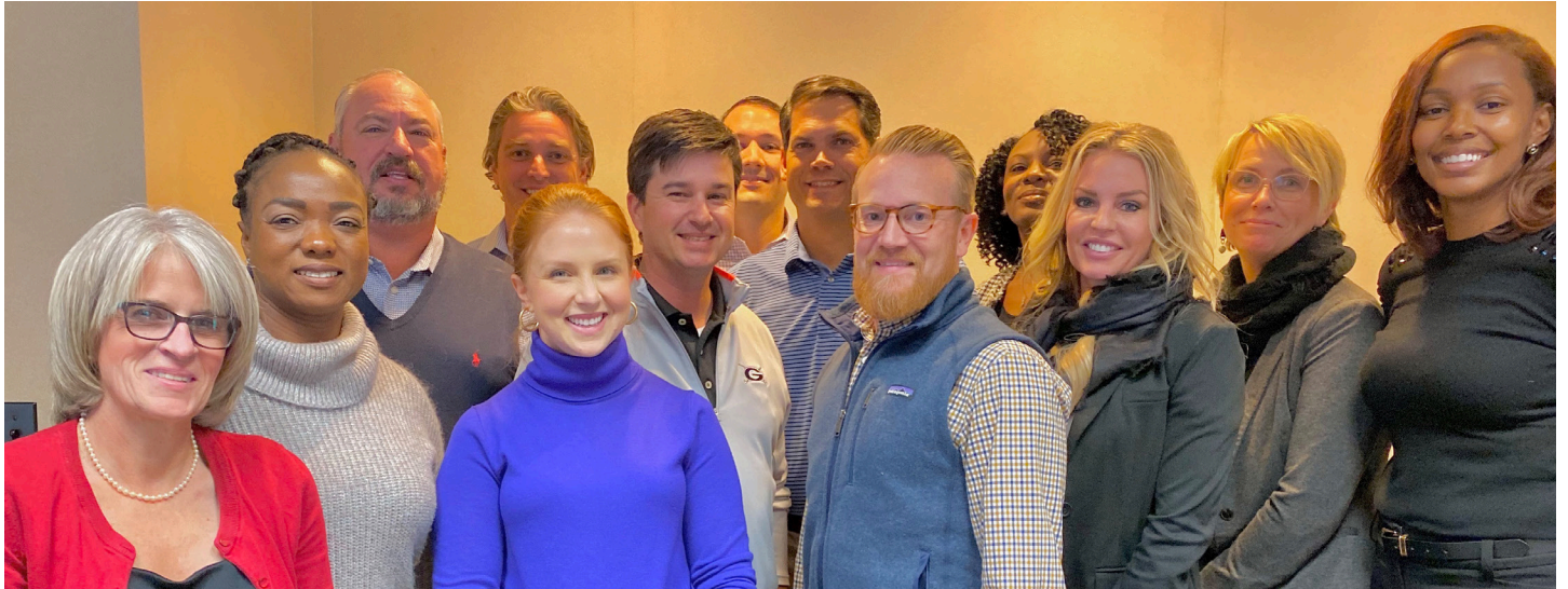
GANA leadership with Lt. Governor Geoff Duncan and Senator Matt Brass