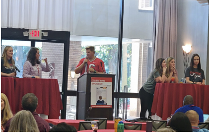
Annual College Bowl

September 29 - October 1, Great Wolf Lodge, LaGrange, GA