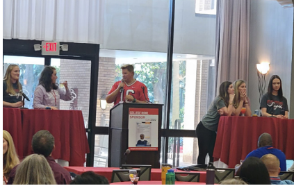
Annual College Bowl

September 29 - October 1, Great Wolf Lodge, LaGrange, GA