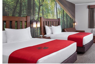
Great Wolf Lodge