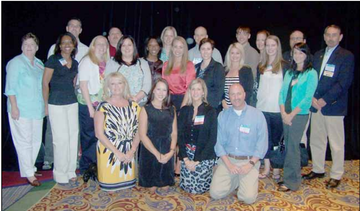
The Class of GHSU 2012 at Mid-Year Assembly

The Class of 2012 (Senior Class) is currently scattered about the state and practicing anesthesia in a variety of settings. Specialty rotations in cardiothoracic, obstetrics, neurosurgical, pediatrics, regional, and burns are underway. Many of the students from the senior class attended the Valley Review in preparation for the quickly approaching certification examination. These students are also seeking out prospective jobs and submitting resumes. Less than eight months until graduation! Time flies when you're having fun! ■