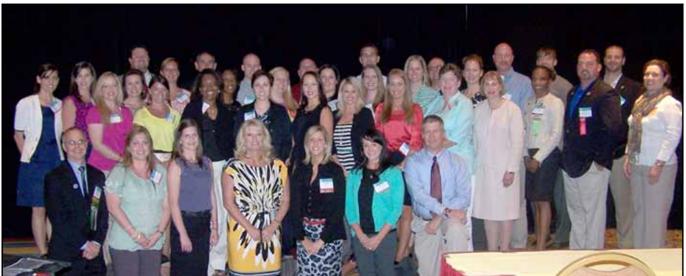
Forty Georgia CRNAs and SRNAs at the 2012 AANA Mid-Year Assembly in Washington, DC.