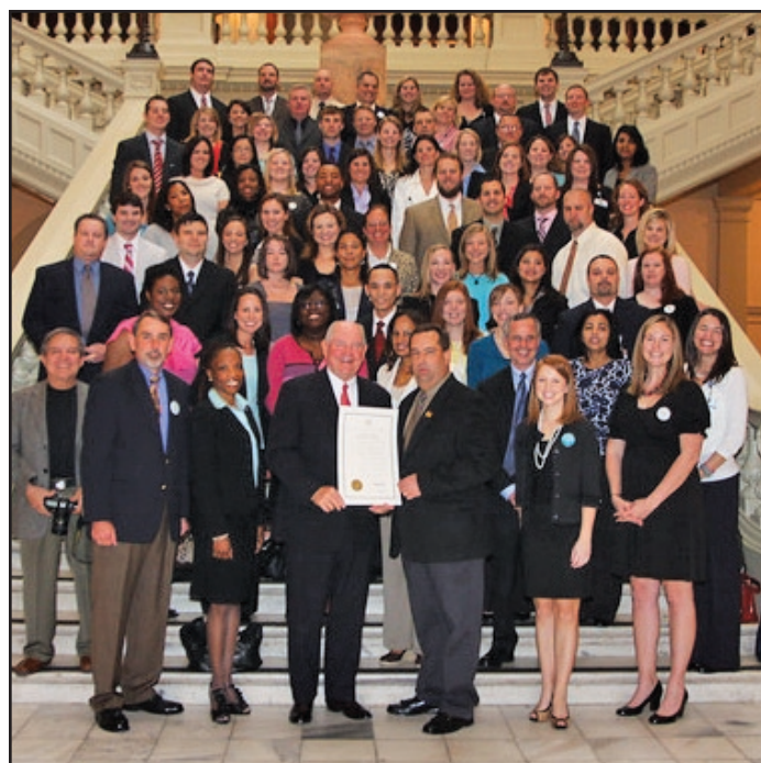
GANA representatives meet with the Governor during Capitol Day