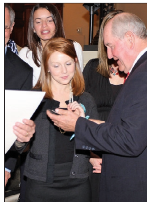
Governor Sonny Perdue signs a proclamation recognizing CRNA Week in Georgia.