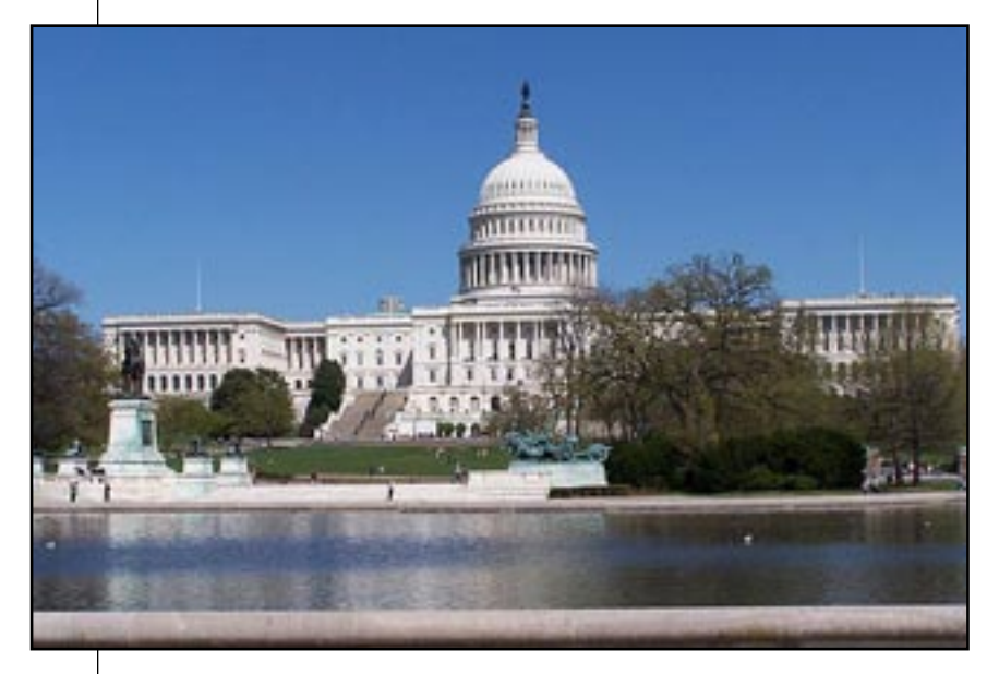
Our nation's capitol